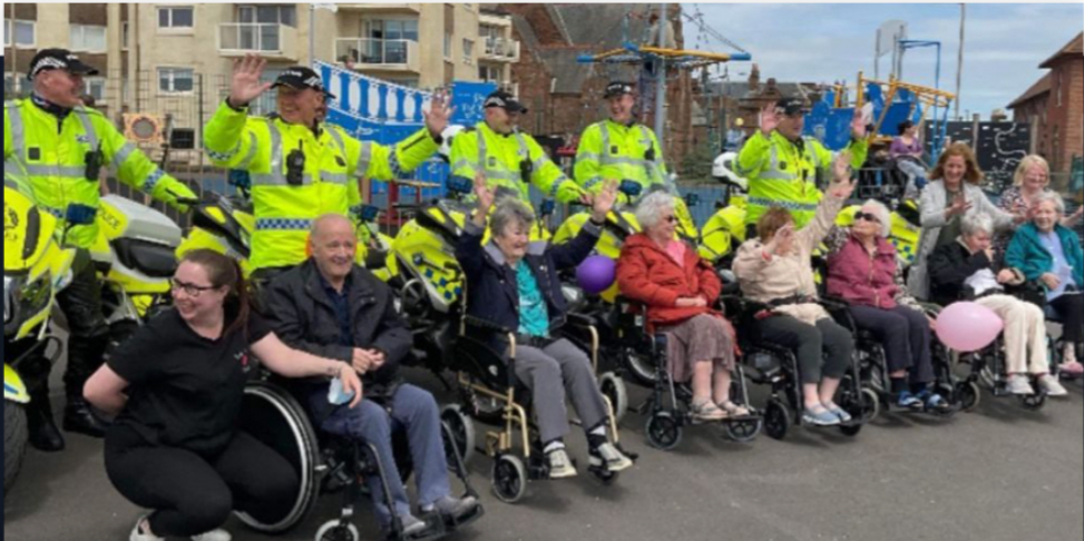
A Day To Remember